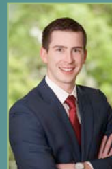
2017 - Leigh McCloskey